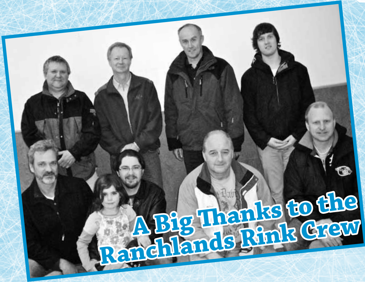
A Big Thanks to the Ranchlands Rink Crew